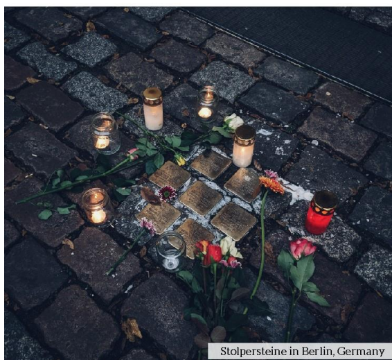
Stolpersteine in Berlin, Germany