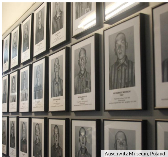
Auschwitz Museum, Poland