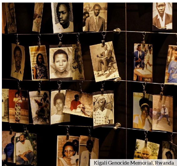
Kigali Genocide Memorial, Rwanda